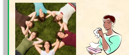
WWF / GRG